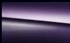
Northern lights violet