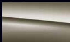
Monolith grey metallic