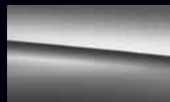
Mountain grey metallic