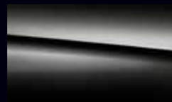
Cosmos black metallic