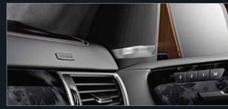
Harman Kardon® Logic 7® Surround Sound System