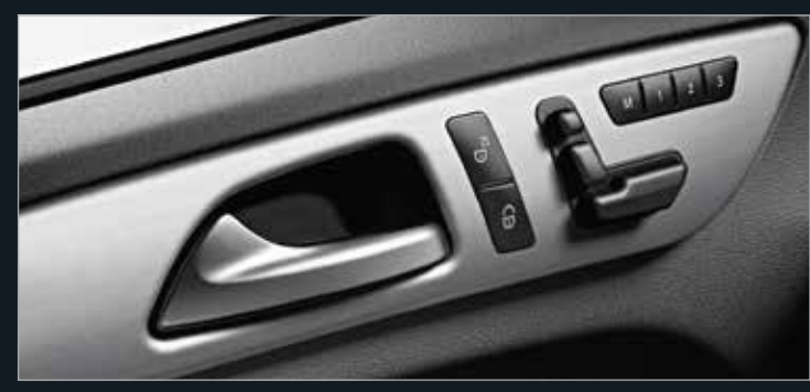
Front seats electrically adjustable with memory package**