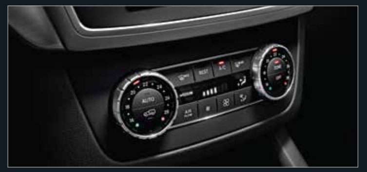
THERMATIC automatic climate control with 2 climate zones