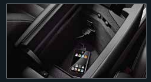
Media interface include consumer cable kit