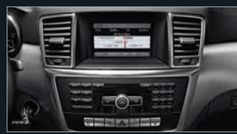
Audio 20 with 6-disc CD-changer