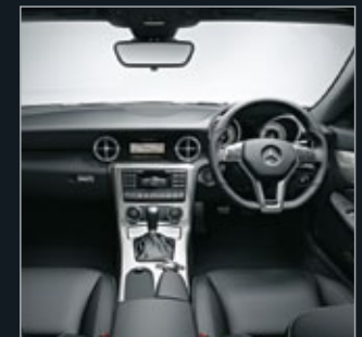
Cockpit and Dashboard Interior