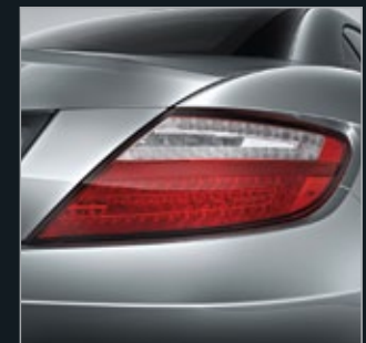
LED Tail Lights