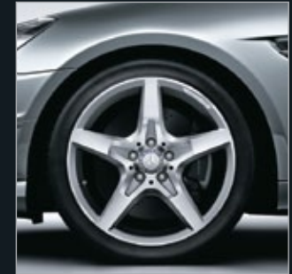
Wheel Rims SLK 250 AMG