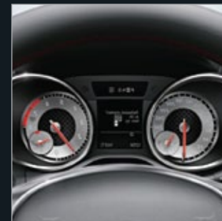
Parktronic with parking guidance