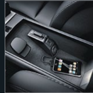
Media Interface, Universal Interface in the center