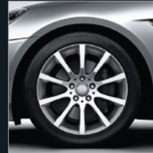
Wheel Rims SLK 200