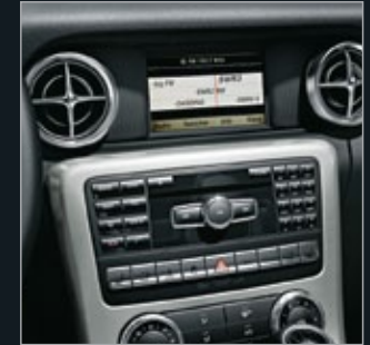
Audio 20 CD with CD changer