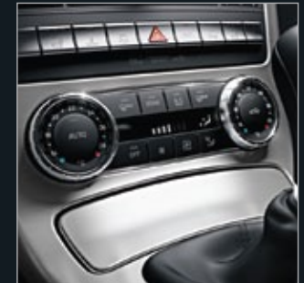
THERMOTRONIC Climate Control