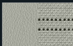
ARTICO/Corumba fabric grey*