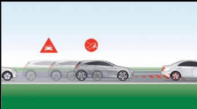
COLLISION PREVENTION ASSIST PLUS