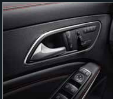
Electrically Adjustable Front Seats, with Memory Function