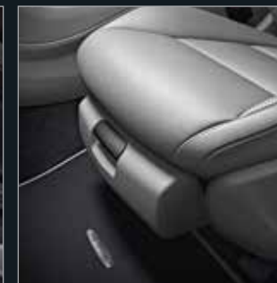
Stowage Space Package