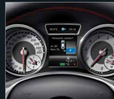
Active Parking Assist