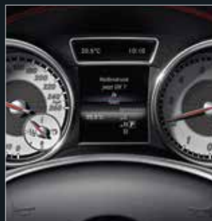
Tire Pressure Loss Warning System