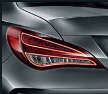
Tail Lights in LED Technology