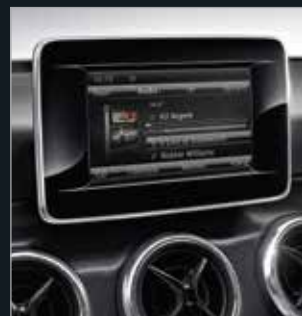
Audio-20 with 6-disc CD Changer