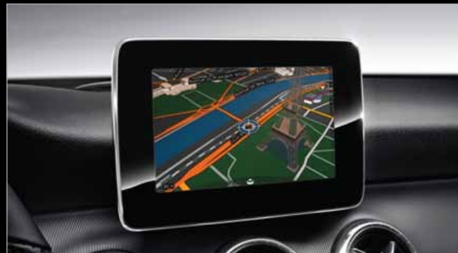
SD-card slot for Garmin MAP PILOT

The system gives the driver a visual warning if the distance from a vehicle in front is inadequate. On detecting the danger of a collision there is an acoustic warning, driver braking can be assisted and, if the driver fails to react, the speed can be reduced autonomously